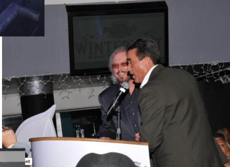
...st Boat Parade at Seminole Hard Rock Hotel & Casino - Hollywood, Fla.

SEMINOLE Hard Rock HOTEL WINTERFEST BOAT PARADE